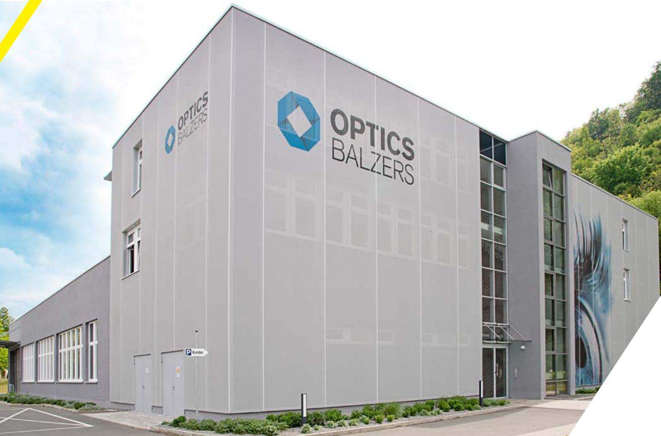
Laboratory building of Optics Balzer Jena GmbH, Jena / Germany