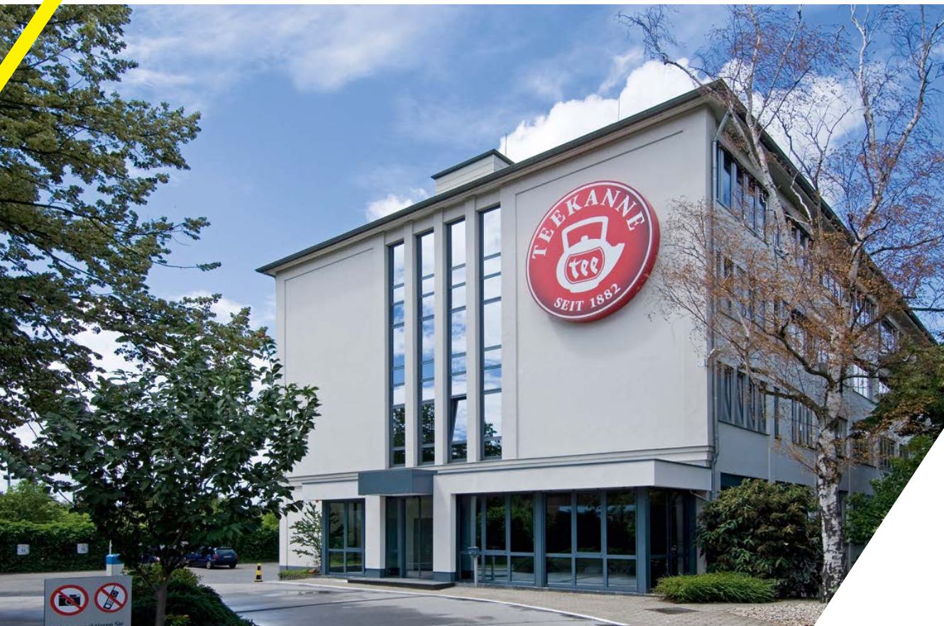
Teekanne tea house, Düsseldorf / Germany