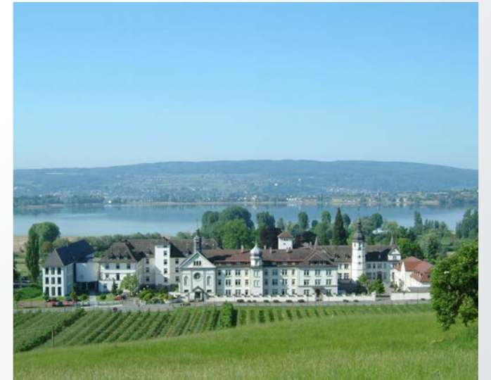
Paratrooper barracks, Seedorf

The congregation of the "Sisters of Mercy of the Holy Cross" was founded in 1856 by the Swiss Capuchin Father Theodosius Florentini and follows the tradition of St. Francis of Assisi. The convent in Hegne is considered the seat of the sisters there. KEMPER brought various product groups into play during the renovation of the drinking water installation in this provincial house.